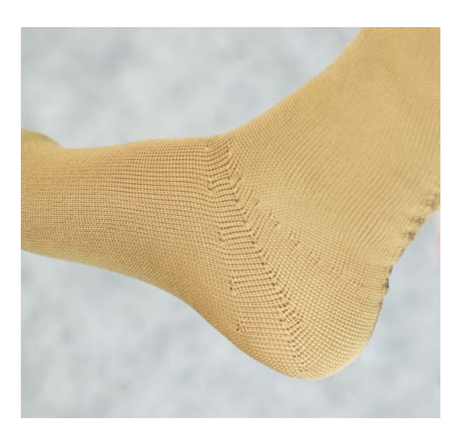
Figure 3. The 'Y' heel ensures even distribution of fabric across the top of the ankle for added comfort

Length measurements should be taken straight unless there are extensive shape changes to the limb that would require measurement to follow the contour of the leg. When measuring the circumferences at 'H' it is important