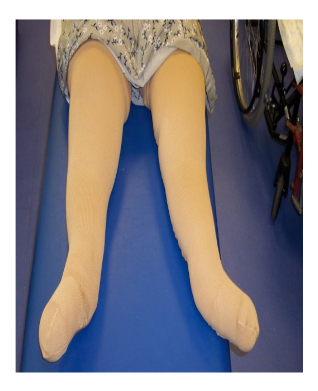
Figure 8. he shape of Mrs S's leg was a challenge for garments to fit and although preferring circular knit garments, these had never been comfortable for her

flat knit compression prevented any refill back into the limbs.