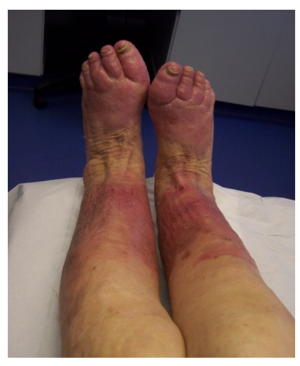
Figure 5. Mrs D was referred to the lymphoedema clinic following several years of compression bandaging to treat her long-standing lymphovenous oedema