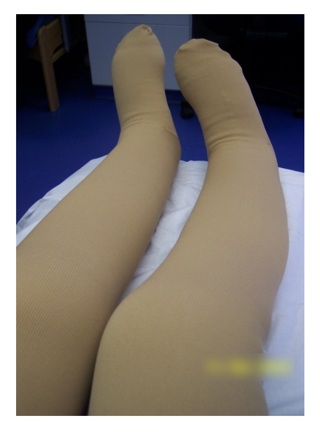
Figure 6. Following discussion and measurement it was agreed, that Mrs D would be fitted with a made to measure pertex light garment, class 1

hadhealth.com), however, this does not replace formal training in the measuring and fitting of made-to-measure garments; made-to-measure courses are available.