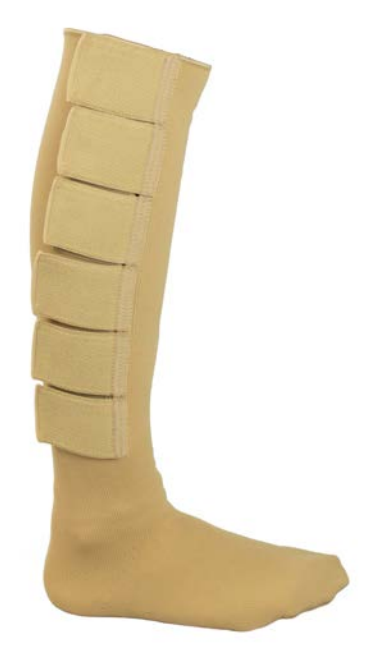
Figure 2. Where patients do not have dexterity to be able to use a zip there are options for a Velcro strip as an alternative or Velcro straps, which sit horizontally at set points throughout the garment

a machine, using more threads providing a stiffer fabric finish. The edges are then sewn together to complete the garment with a seam along its length. Due to their increased stiffness, they sit on the tissues providing a lower resting pressure and tend to be more comfortable. If the tissues are more pitting they can sit on the limb without constriction and are tolerated better by most patients. Although not as cosmetically pleasing, their performance and comfort are reported as better than a circular knit. Selection of the correct patient and condition is paramount to ensure compliance and performance and sometimes the need for a higher class circular knit garment can be reduced by using a stiffer, flat knit garment of a